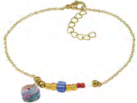
ANK22011-01 USD 3,85

Stainless steel chain anklet with mixed beads and recycled plastic bead charm.