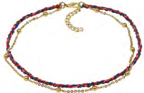
ANK22014-01 USD 2,65

Anklet with handtwisted cotton string and gold color stainless steel ball chain.