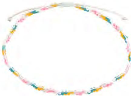
ANK22012-01 USD 1,04

Handwoven Japanese glass seedbead anklet on cotton string.