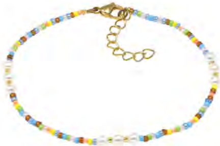
ANK22009-01 USD 1,55

Anklet with Japanese glass seedbeads and synthetic pearls.